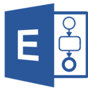
Enterprise Explorer ®